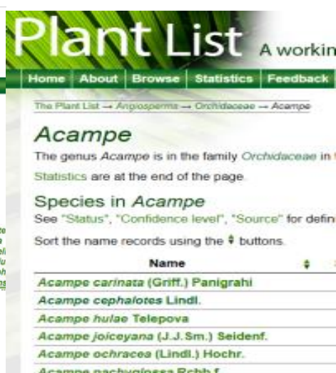
screen shot 2

interested in - Acampe cephalotes . Of course, if you are not too sure of the correct spelling it does not matter as you are selecting from a list, as opposed to typing in what you thought was the correct spelling – even with the use of wildcards. Very simply done.