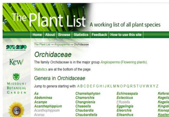
screen shot 1

This then opens another alphabetical list of the species orchids in that genus. (The total number of accepted species names in these lists is over 71,391 consisting of over 27,000 accepted names and almost 40,000 synonyms.) Scroll through the list (screen shot 2) and select (left click) the name of the orchid you are